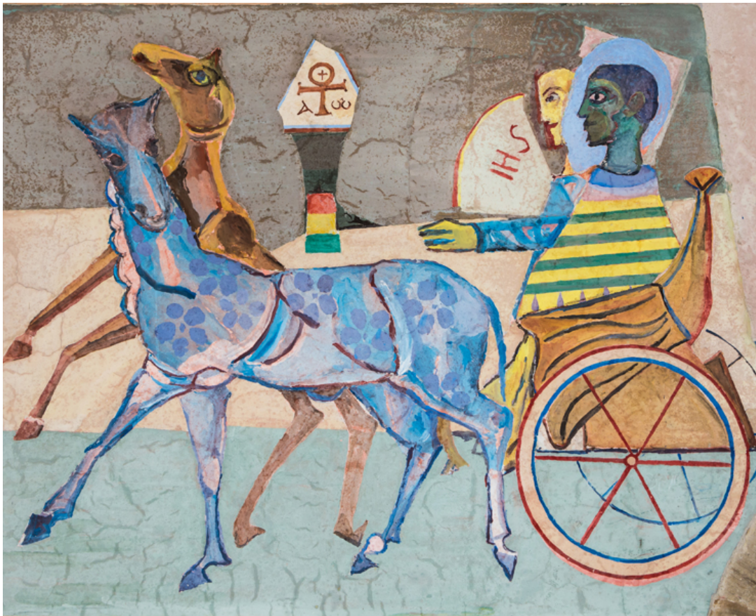
From the Seckau Abbey in Styria, Austria; "Philip and the Ethiopian Eunuch"