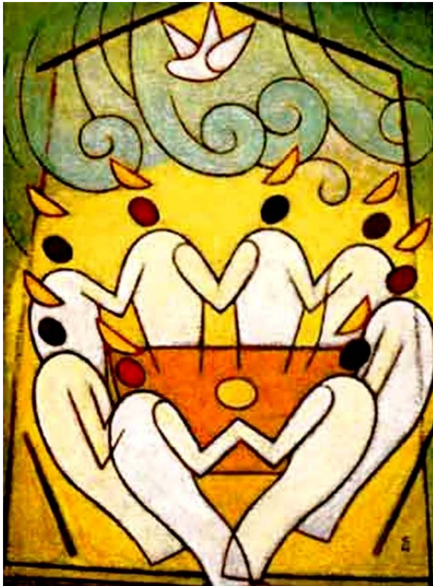
Soichi Watanabe (Japanese, 1949–), The Coming of the Holy Spirit, 1996. Oil on canvas, 18 × 13.25 in., https://artandtheology.org/2016/05/15/pentecost-art-from-asia/