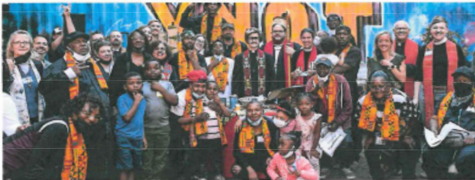
North Ave Mission (NAM) in Baltimore, the only synodically authorized worshipping community in the Delaware-Maryland Synod to launch during the pandemic, gathers outdoors for worship each week.